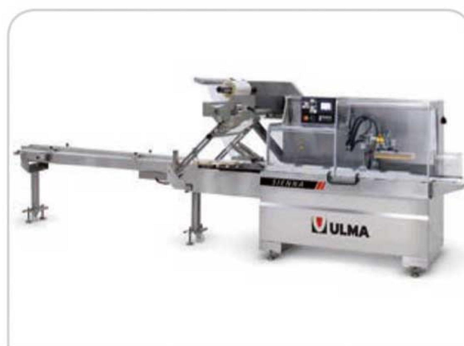
Top reel version