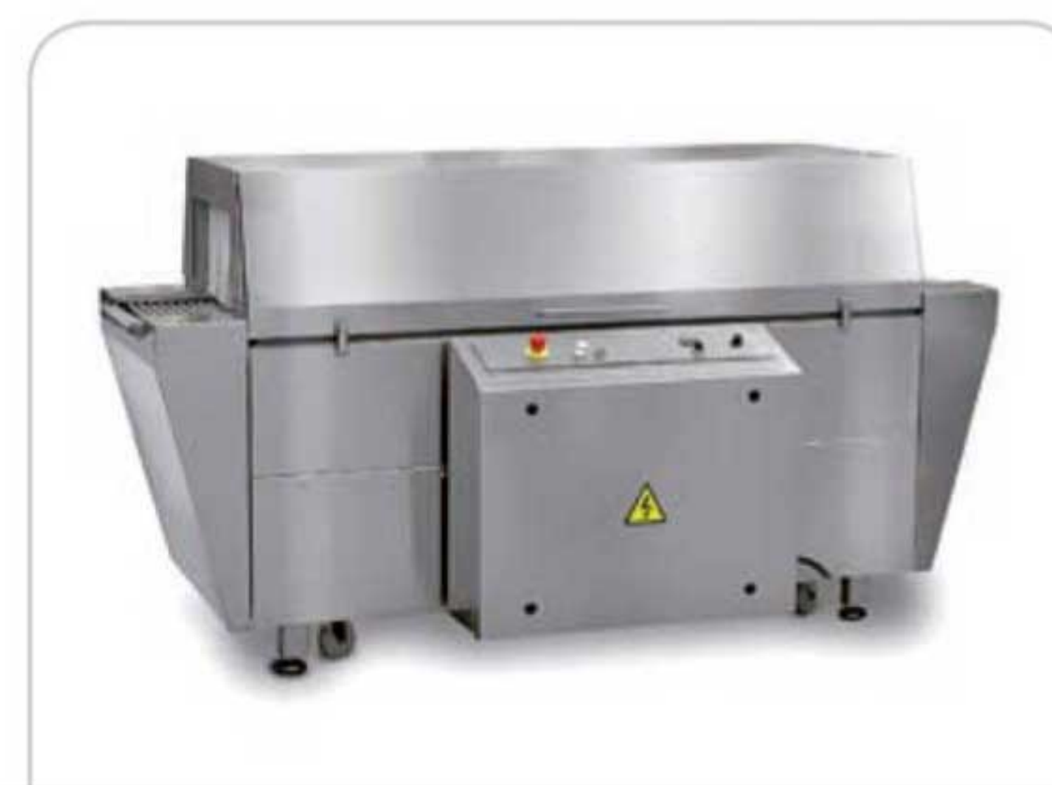
Openable top cover shrink tunnels