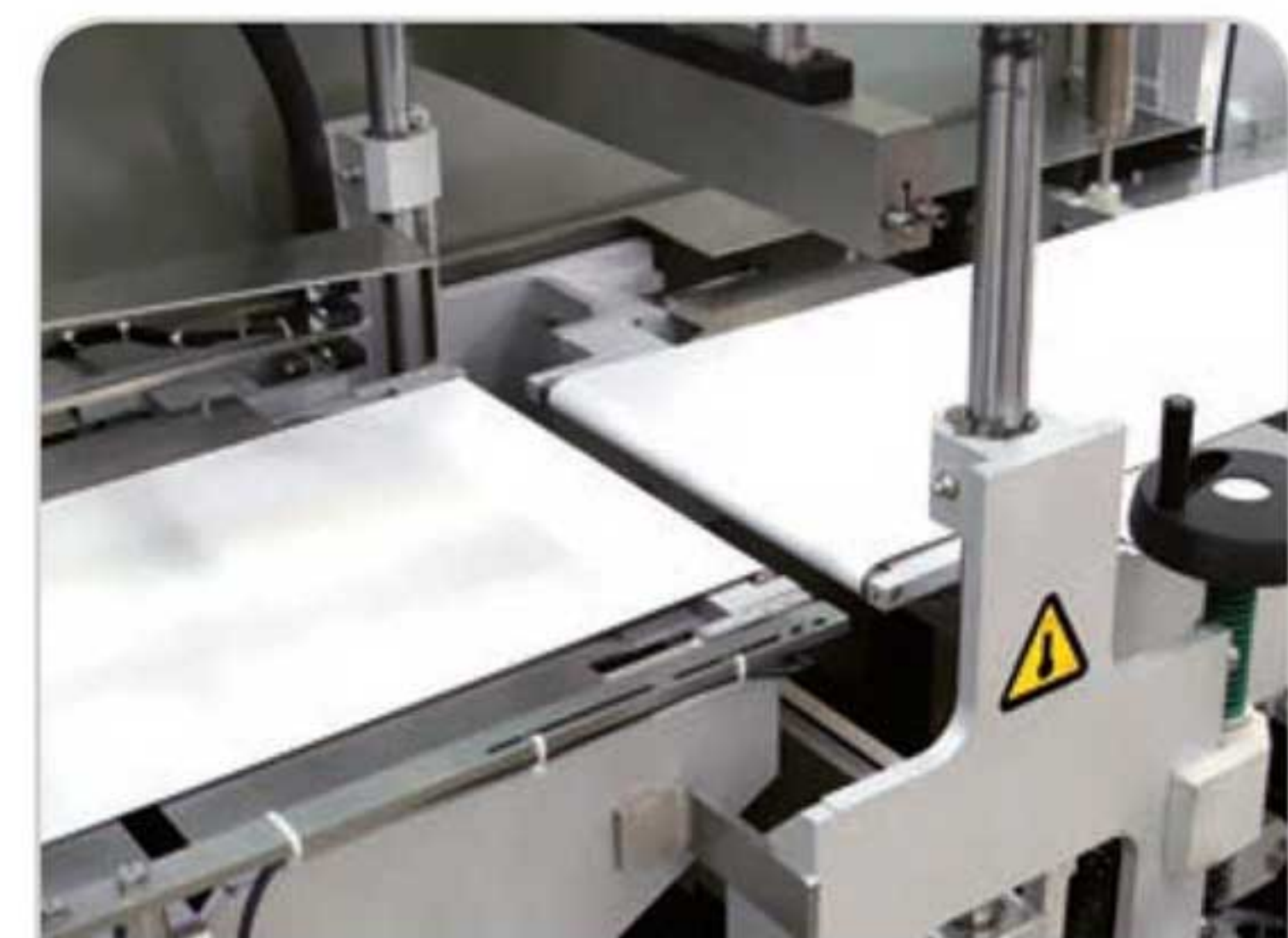
Sealing heading designed to avoid dirt accumulation