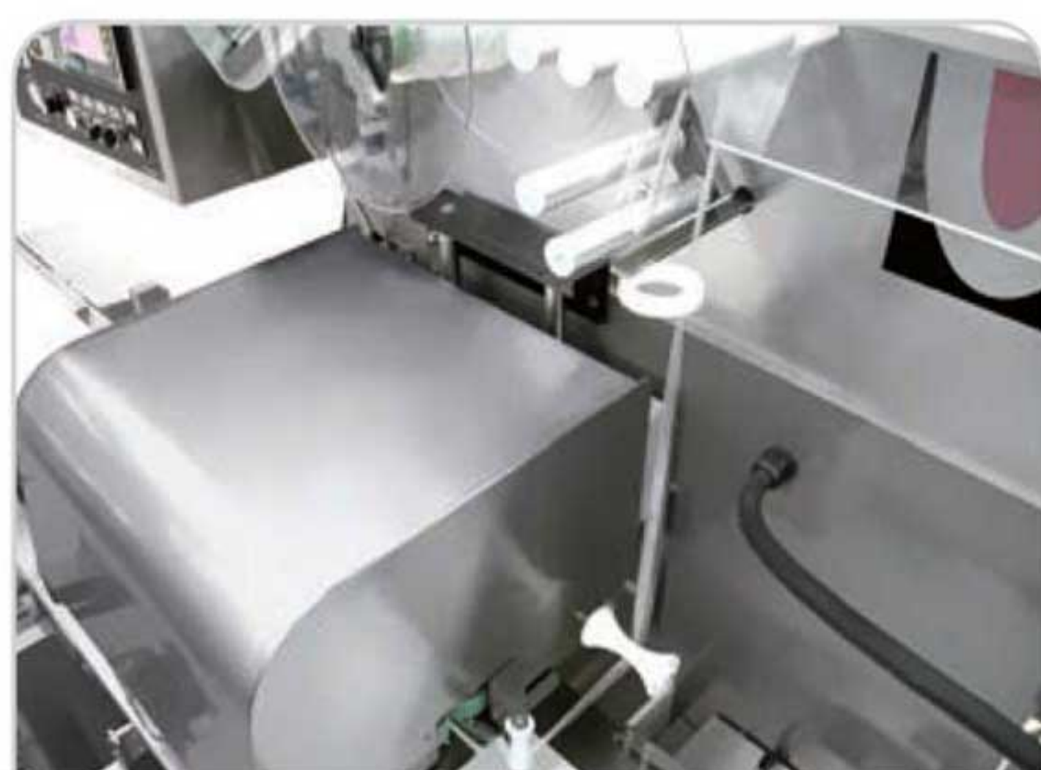
Shrink film version