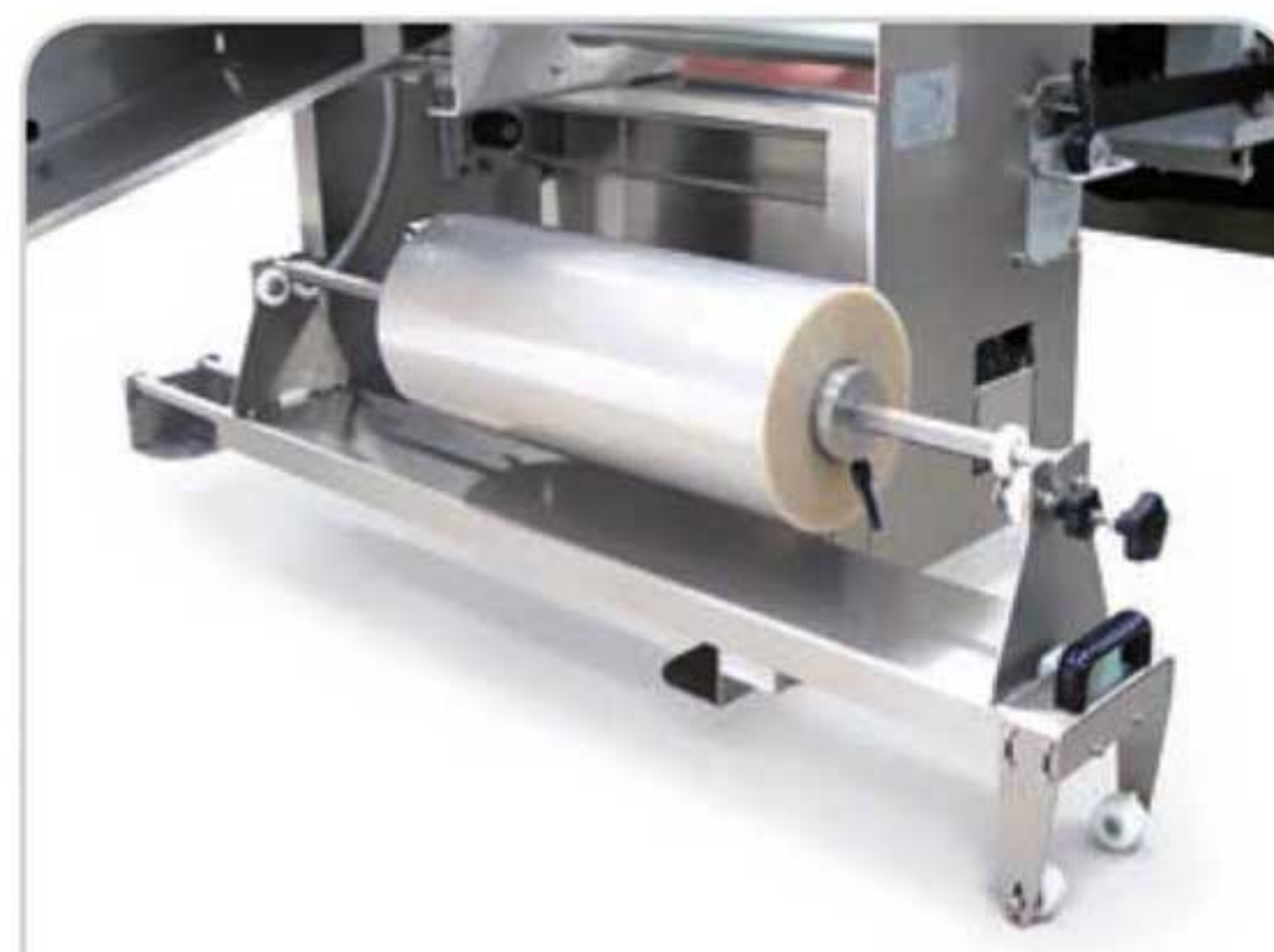
Reel holder designed for easy loading