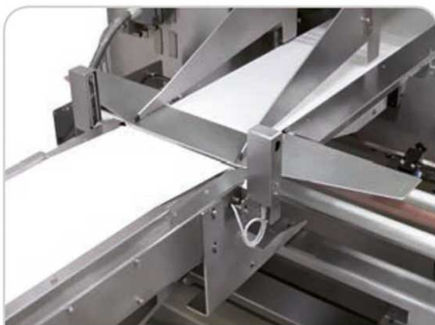
Belt type in-feed conveyor