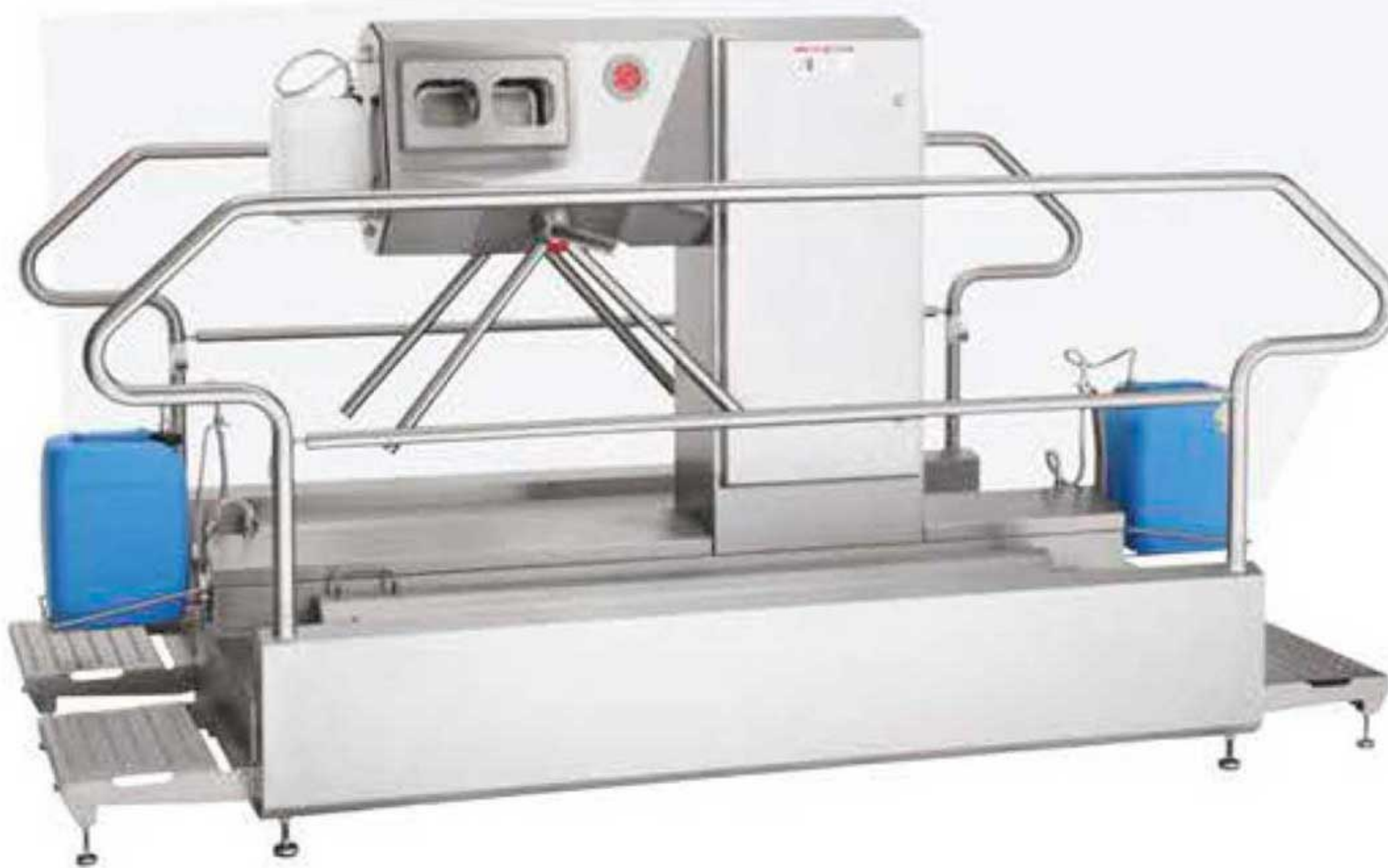
Star Clean IV Compact type 23891-1600