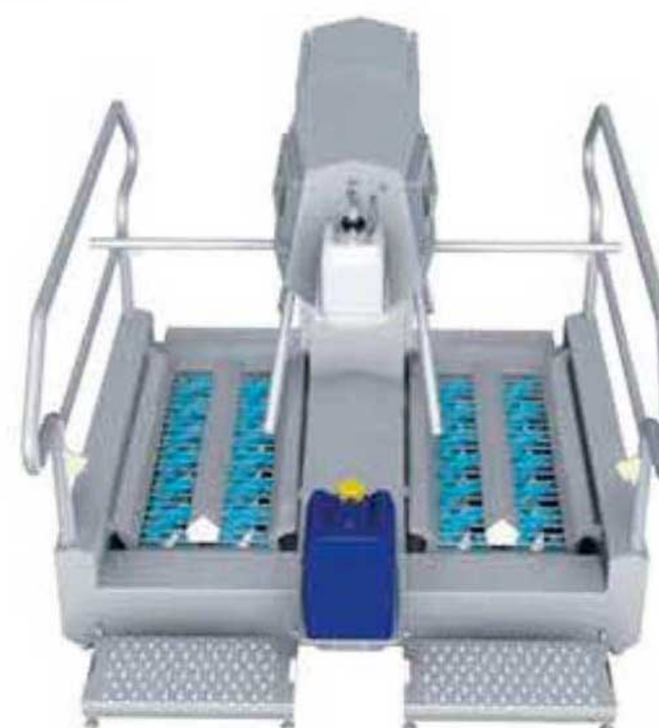
Star Clean IV Compact type 23892-1000