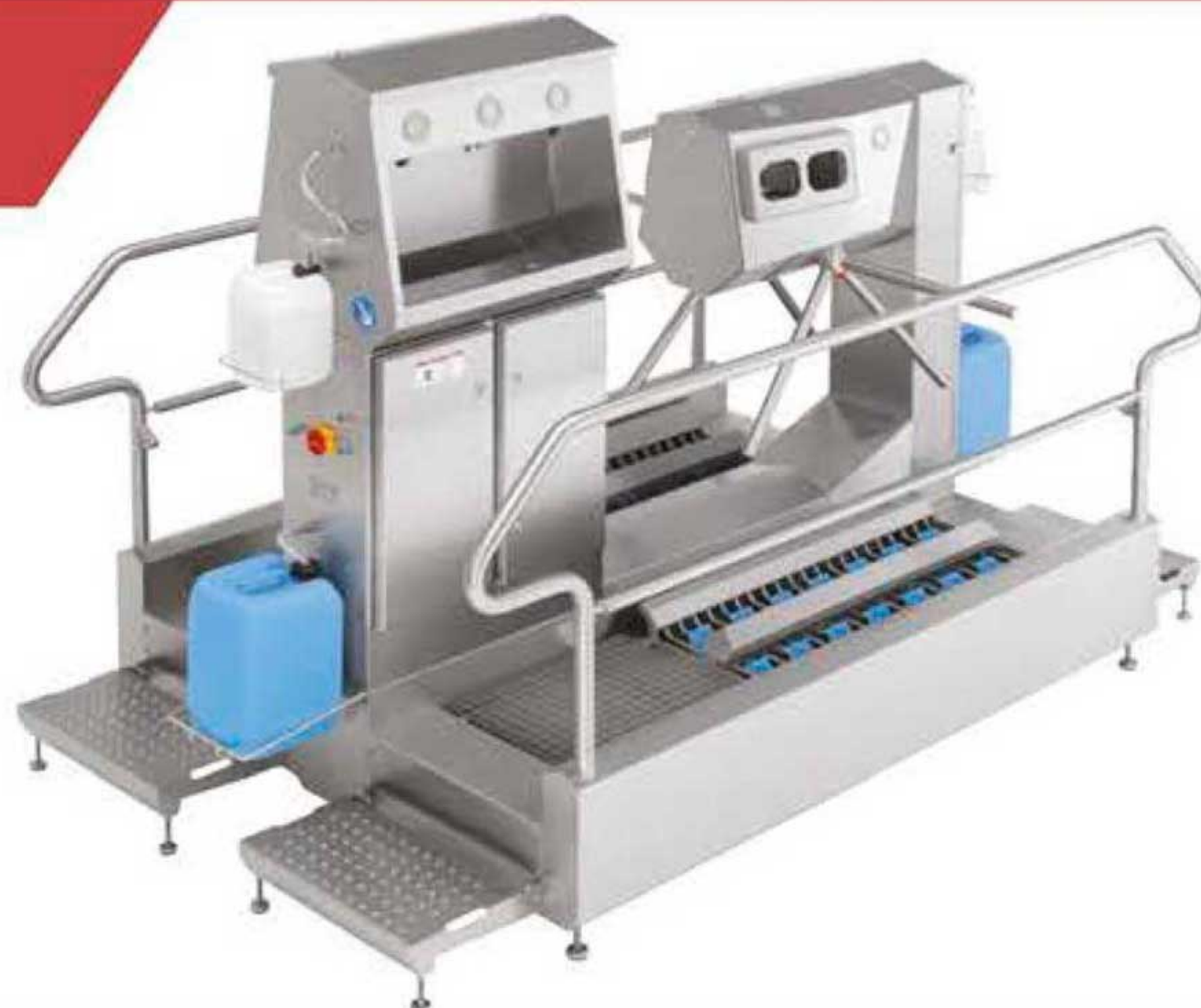
Star Clean IV All in One Compact type 23893-1600